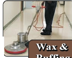
Wax & Buffing