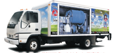
When You Want It "REALLY" Clean! Ask for the "BIG" Truck

Experience the benefits of advanced floor cleaning technology and dependable service