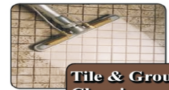
Tile & Grout Cleaning