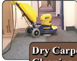
Dry Carpet Cleaning